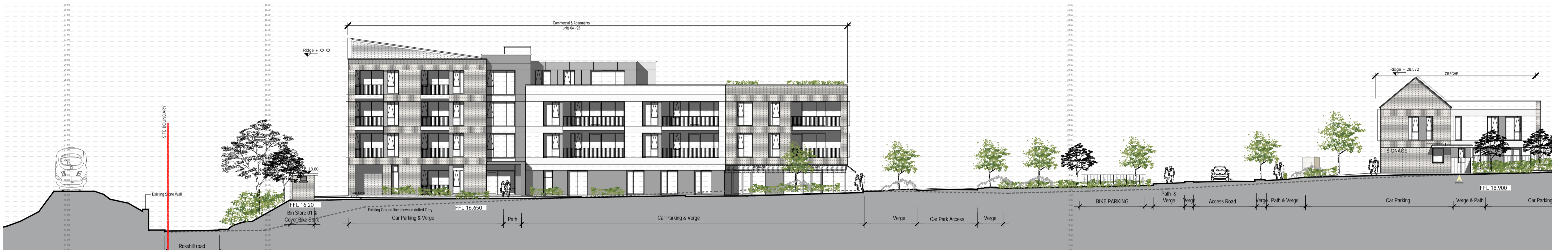
01 Site Context Elevation C-C PART 1 Scale: 1:200