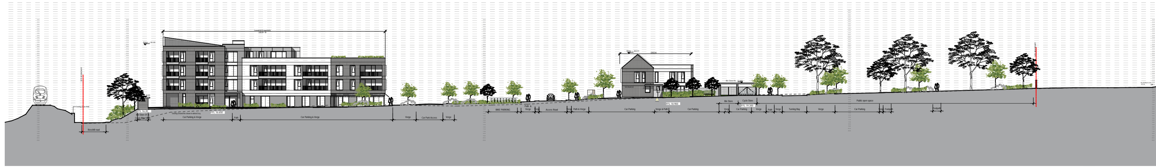
01 Site Context Elevation C-C Scale: 1:500